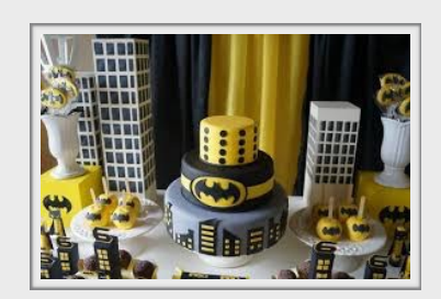
Themes: Spa Superhero Princess Arts and crafts

You and your child will arrive approximately 15 minutes before the party begins. We do all the work (clean up too!).